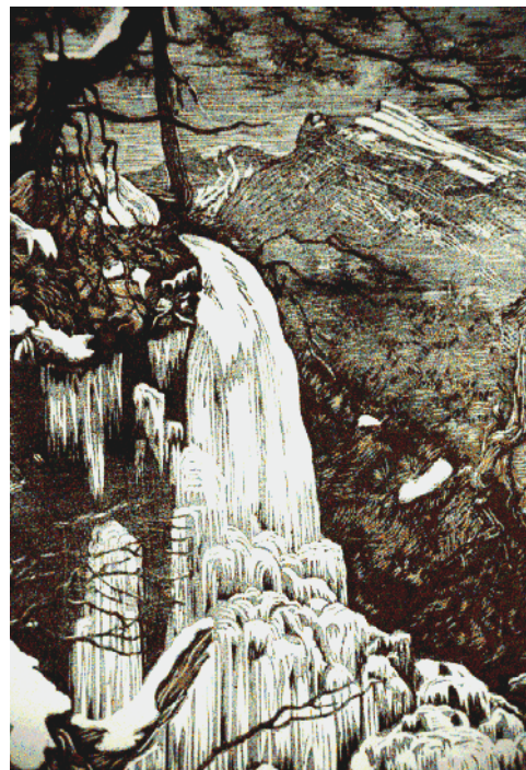
A self portrait of Konrad Zuse in 1945 and a color woodcut of the Zifpelsfälle in Hinterstein.