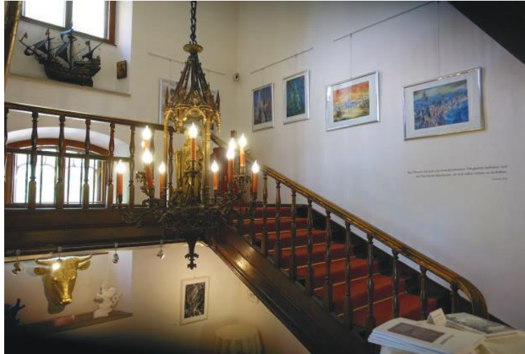
In the castle of Hopferau, there are many paintings by Konrad Zuse.