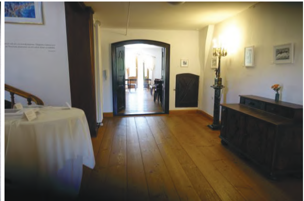
The exhibition of the woodcuts were in the stair floor of the castle.